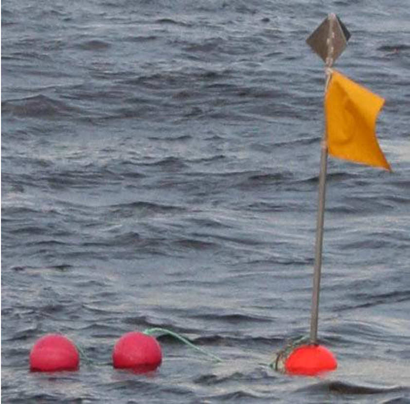
Dhan buoy surface markers